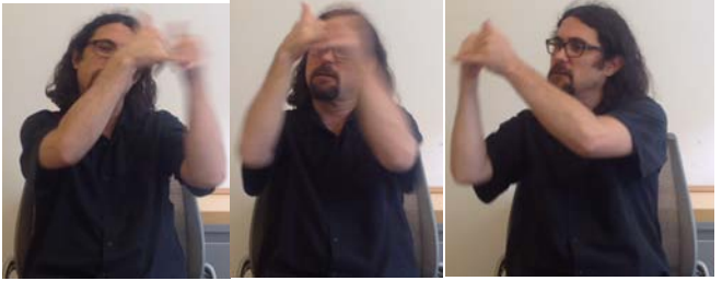
(25)b: 3 unpunctuated iterations, triangular

(25)a: 3 unpunctuated iterations, horizontal