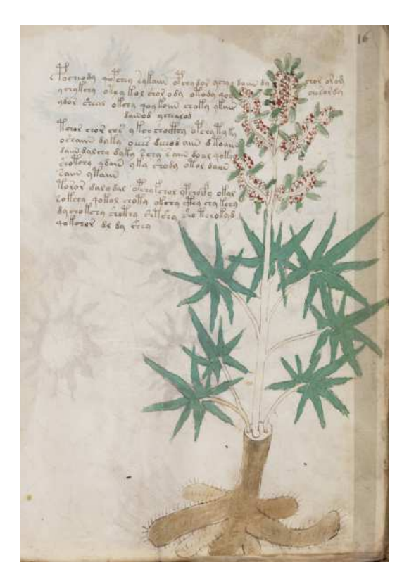
Figure 1: Page f16r of the Voynich manuscript. For a magnified view of the text, see Figs. 6 - 8.

After we present the transliteration table, we propose at a putative translation of the VM page f16r which features a picture that without reasonable doubt can be identified as cannabis, see Fig. 1. We find that the author of the VM does not dwell on the botanical or pharmaceutical properties, but mainly advises the reader to abstain from the use of the plant. In combination with the circumstantial evidence from a few other pages, the VM can be seen as an example of wisdom literature , although not as a particularly impressive one. The text largely appears to be, roughly speaking, a "rant" against any less wise fellows, rather than a sensible argument to convince feeble believers. We can speculate that the text has some gnostic influences (see Section 2.3). In the Persian-influenced regions as well as in Europe, the ideas of the Gnosis survived as an undercurrent in various mixtures with Christianity, Mandaeism, Zoroastrianism, Yazidism and Manichaeanism. During centuries of suppression and persecution many of their scriptures were lost, such that the VM eventually could help to disentangle the complex interplay of these religions. A strong Islamic influence can be ruled out, because in this case it would be ununderstandable why the text was not written in the widely-used standard (Arabic) Persian alphabet. Instead, the similarity of the Voynichese alphabet with Pahlavi and Mandaic scripts can be taken to suggest a Zoroastrian or Mandaic background.