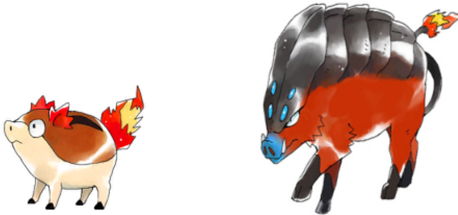
Figure 1: An example of visual stimuli. Left, pre-evolution character; right, post-evolution character.

characters are generally larger, they were about 1.5 times larger than the pre-evolution versions. An example pair of the visual stimuli is given in Figure 1. These visual stimuli were drawn by a digital artist, toto-mame , whose Pokémon pictures are judged to be very authentic by Pokémon practitioners. 6